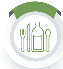
Food & Beverage Industrial UV