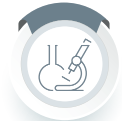
Pharmaceuticals Industrial UV