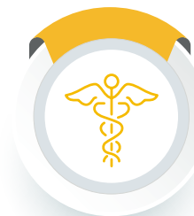
Healthcare Industrial UV